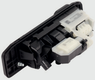
CAR REVIEW CAMERA